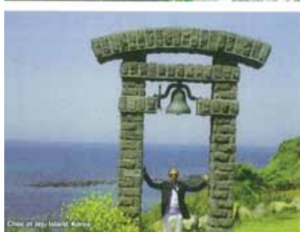
Discussion about Star Development

right information, and freedom of choice, could help as well. It has very little to do with what you can buy but rather what you can experience in the moment.