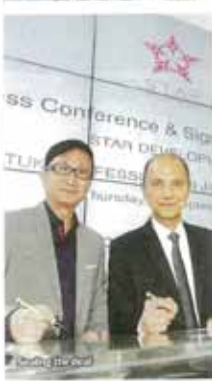
Datuk Jimmy Choo