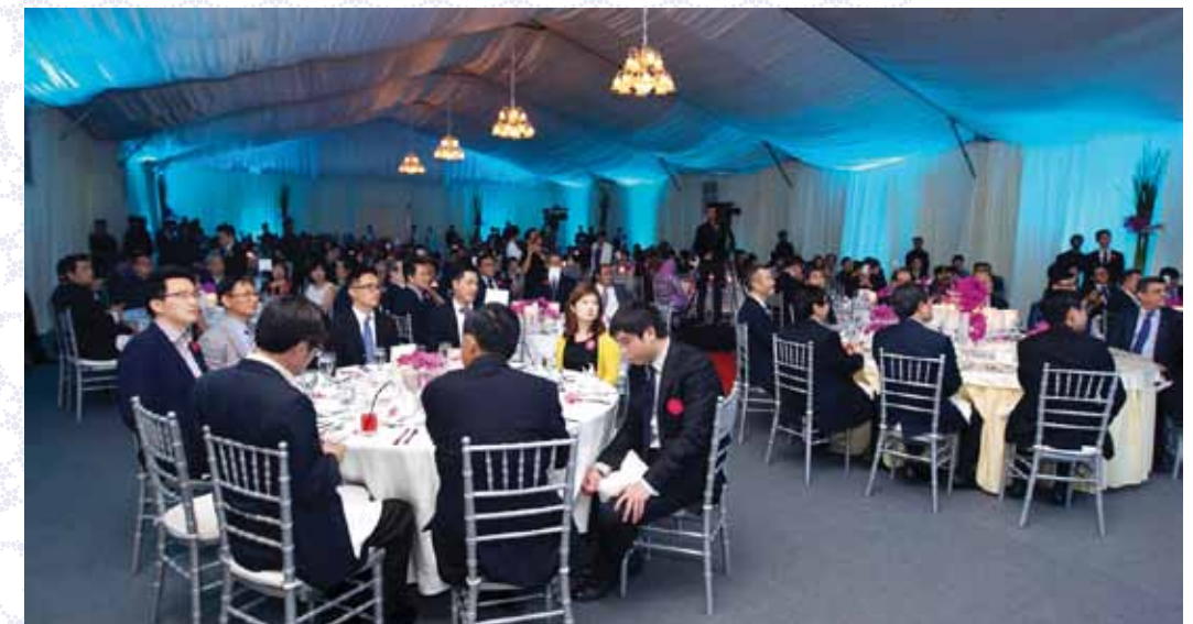
Taking pride in the milestone achievement – a successful ‘Groundbreaking Ceremony’